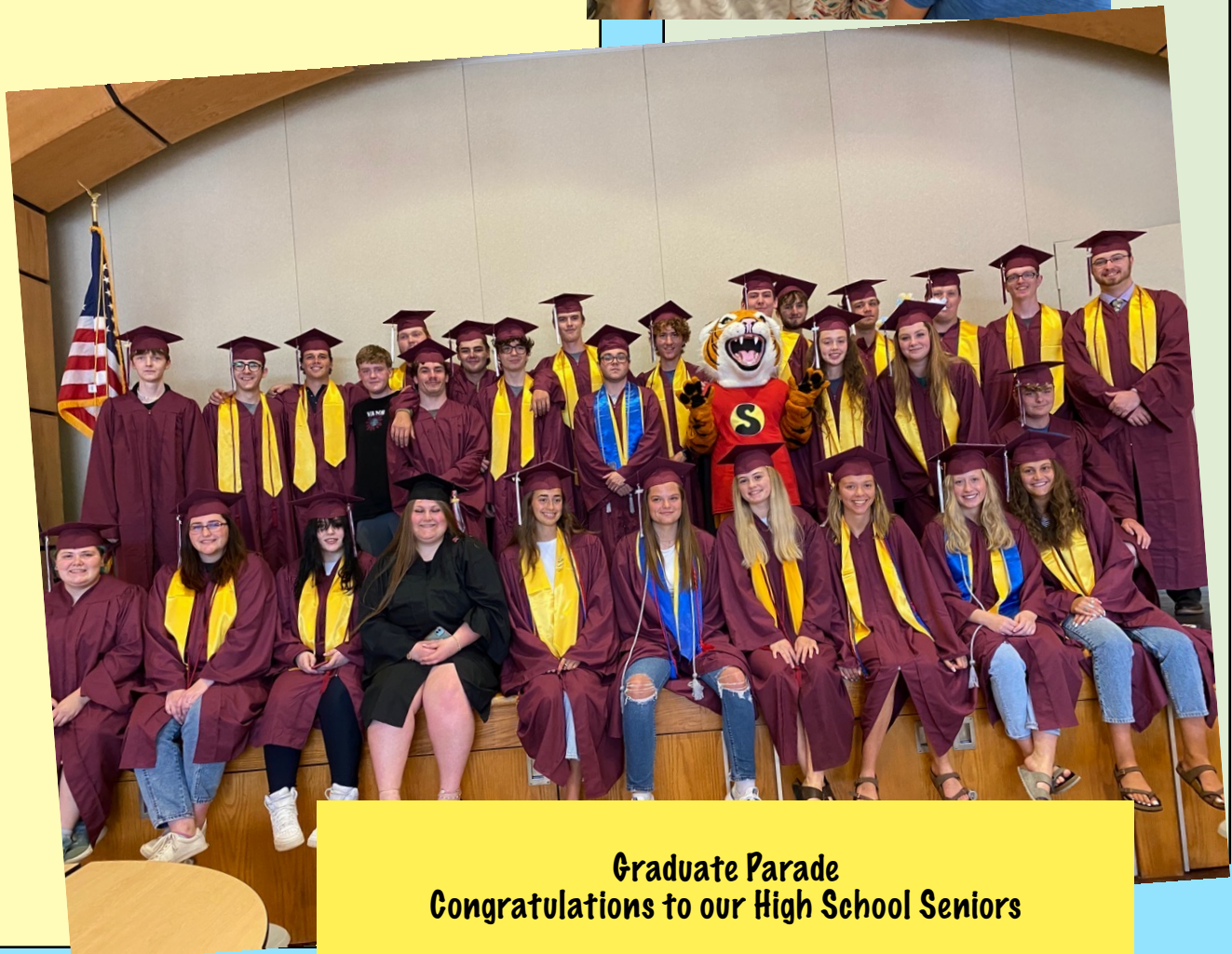
Graduate Parade Congratulations to our High School Seniors